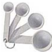
Set of spoons

I use a set of 4 spoons, that are the same as a different unit, a half-teaspoon, a teaspoon, a half soupspoon, a soupspoon. You can make all kinds of combinations and you can try to obtain the desired units. This set of spoons is very handy, cheap and easy to rinse!!